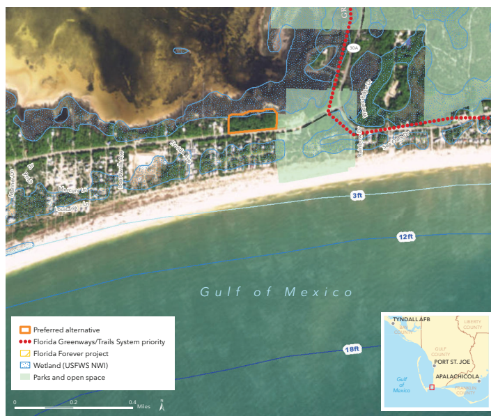
Figure 1: The proposed Salinas Park addition site is outlined in orange and is adjacent to the current Salinas Park boundary.

The second phase of the Florida Coastal Access Project continues restoration planning begun during Early Restoration. The FL TIG prepared the Phase V.2 Florida Coastal Access Project: Final Restoration Plan/Supplemental Environmental Analysis (Final Phase V.2 RP/SEA) which describes and evaluates three proposed restoration alternatives: Alligator Point Park, Little Redfish Lake Addition to Grayton Beach State Park, and Salinas Park Addition (the preferred alternative). Each of the proposed alternatives generally included the acquisition of a coastal parcel, the construction of various park amenities such as parking and restroom facilities, boardwalks, trails, and