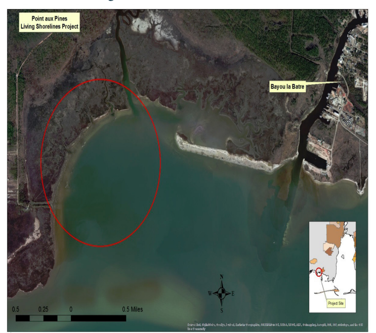
Proposed project site - Point aux Pins Living Shoreline.

The Point aux Pins Living Shoreline project will stabilize shoreline located near Point aux Pins which has shown evidence of erosion over time. In addition to protecting shorelines, the Shell Belt and Coden Belt Road Living Shoreline project will enhance the growth of planted native marsh vegetation.