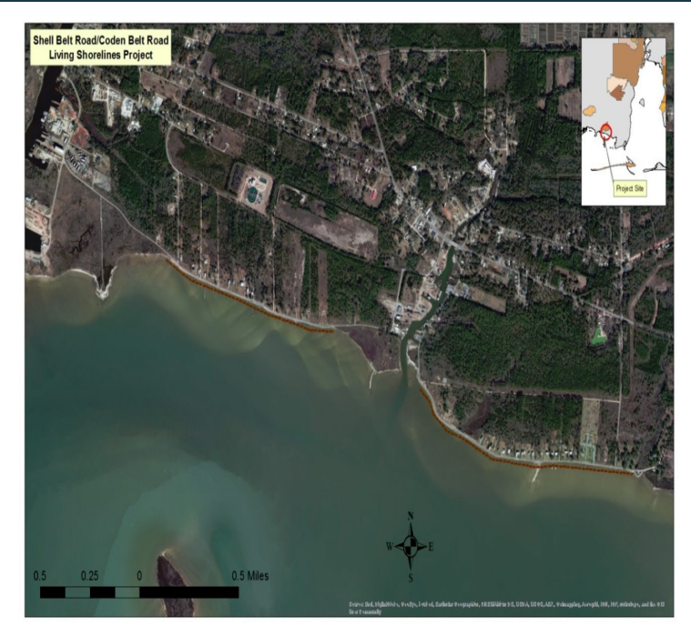
Proposed project site - Shell Belt and Coden Belt Roads

Construction activities for both living shoreline projects will include placement of intertidal breakwater materials that may utilize artificial Wave Attenuation Units. The specific construction techniques and designs will be selected to maximize project effectiveness and meet regulatory requirements. Over time, the breakwaters are expected to develop into reefs that support benthic secondary productivity, including, but not limited to, bivalve mollusks, annelid worms, shrimp, crabs, and small forage fishes.