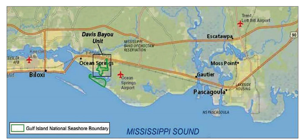
Vicinity Map Gulf Islands National Seashore, Davis Bayou Unit

Members of the public – including day users, overnight campers, and commuters – use this road as walking, jogging, bicycling, and motor vehicle traffic routes. Simultaneous use of the roads by all user groups results in congested traffic and difficult conditions for pedestrians, bicyclists, and motorists.