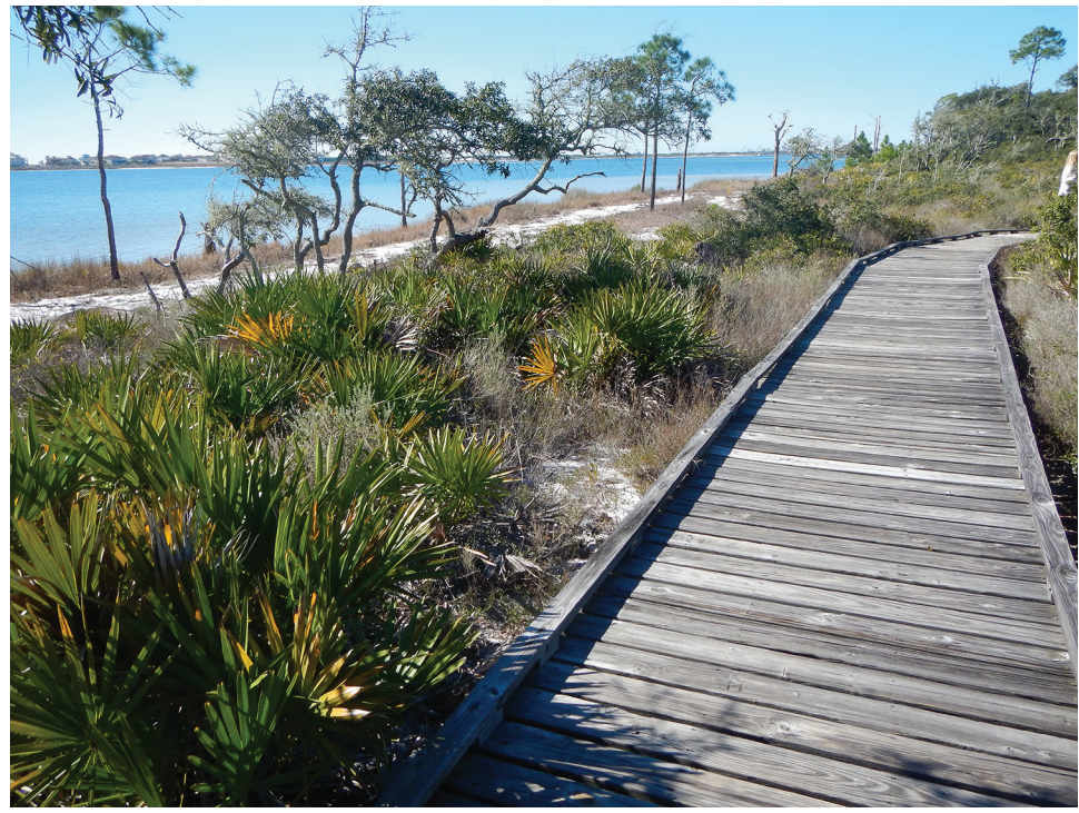
A portion of the existing Jeff Friend Trail as it runs parallel to the shores of Little Lagoon.

The proposed project would replace the 1,250 foot wooden portion of the trail with a composite material boardwalk. The 3,700-foot gravel portion of the