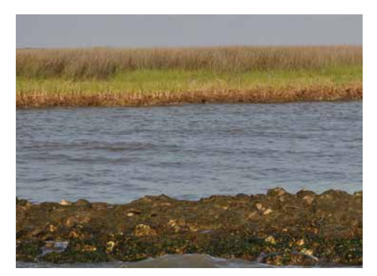
Pictured above is an example of a living shoreline protecting a marsh in the background. With calm, protected waters between the structure and the shore, a diverse habitat is possible for plants and organisms, such as attached animals (like oysters) that provide food for fish and birds.