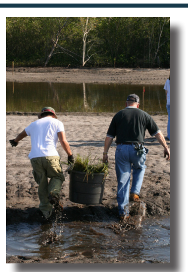
Potential restoration type: planting

A natural resource damage assessment is the process used by natural resource trustees to develop the public's claim for natural resource damages against the party or parties responsible for the spill. It also seeks compensation for the harm done to natural resources and those services they provide.