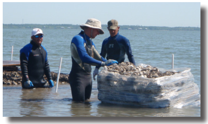
Potential restoration type: oyster reef formation

Natural resource damage assessments can be prolonged and complex, in some cases lasting many years. In the case of the Deepwater Horizon Oil Spill Natural Resource Damage