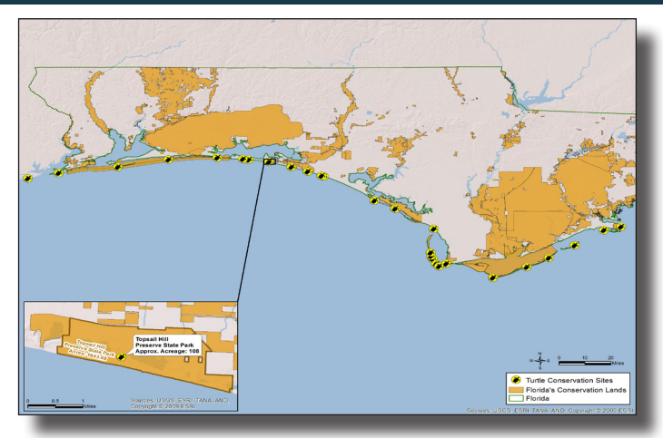
Improving habitat injured by spill response: Restoring the Night Sky project locations.

*Actual costs may differ depending on future contingencies, but will not exceed the amount shown without further agreement between the Trustees and BP.