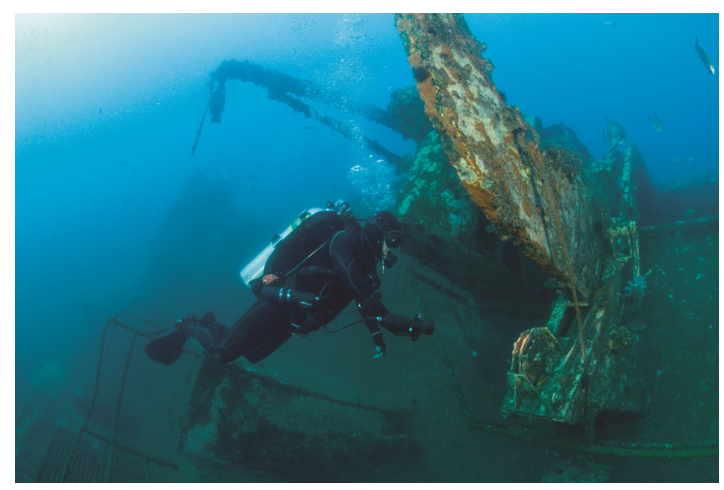
Diver near an artificial reef off the Texas Coast

The location for the Corpus Artificial Reef Project was selected after request for and consideration of public input and in accordance with site selection guidelines set out in the Texas Artificial Reef