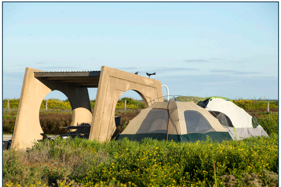
The project will construct more campsites like this one, plus other facilities.

Historically, the state park provided camping facilities and associated amenities for day-use and overnight visitors. However, in 2008 Hurricane Ike devastated the upper Texas coast and destroyed much of the park's infrastructure. To guide the restoration process, Texas